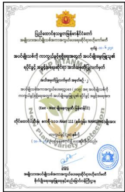
Asparagus -bean (Akari 111 (NAMGANG))