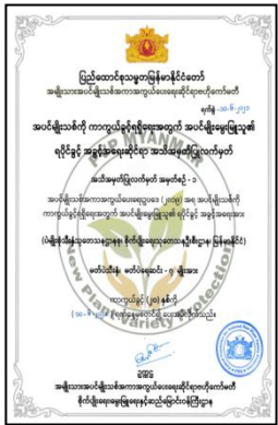
Black gram Yezin-7