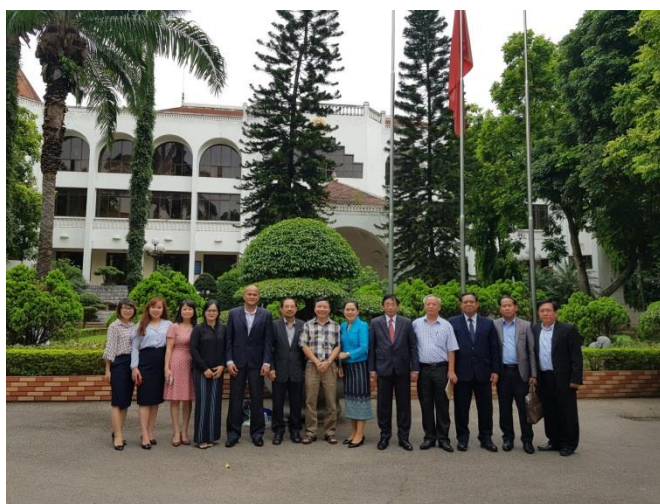
In front of MARD