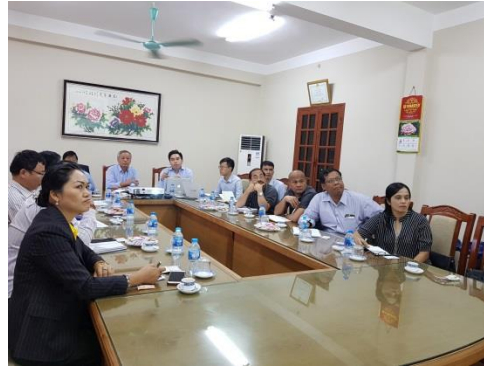
Meeting in the Research Center of VINA Seed Corporation