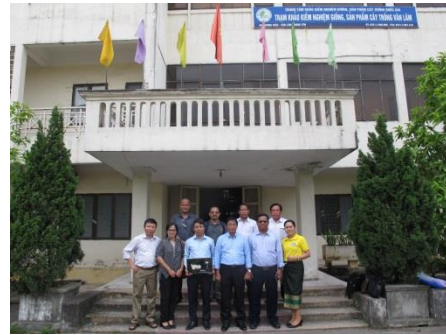
Group photo in front of the station