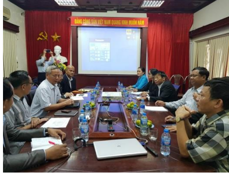
Meeting and presentation on Plant Variety Management and PVP system of Vietnam