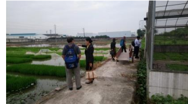
Visiting the field for DUS Testing of Rice