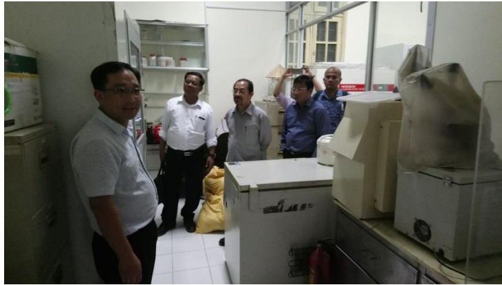
Visiting the Seed Lab for Seed Testing