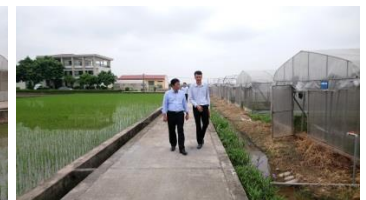
Visiting the facility for R&D of the Center