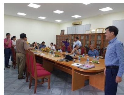
Meeting and listening the presentation on the function and duty of NCPT in PVP system