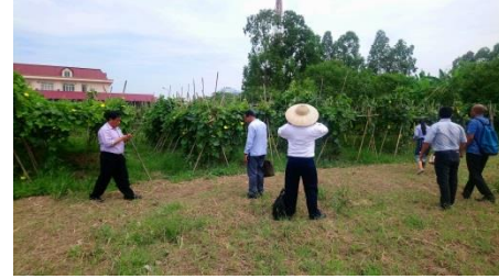
Field trip and the DUS Growing Test of Luffa (just finished)