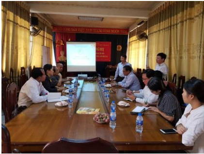
Presentation on the function of the station