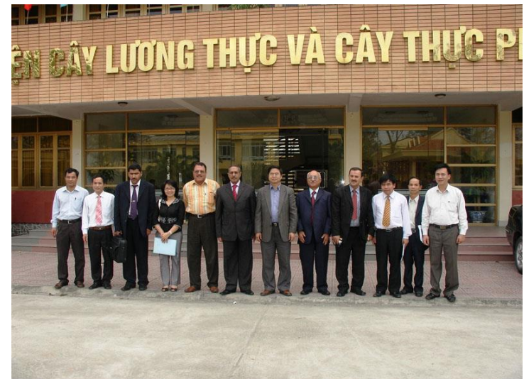
Research Institute for Food Crops (RIFC)