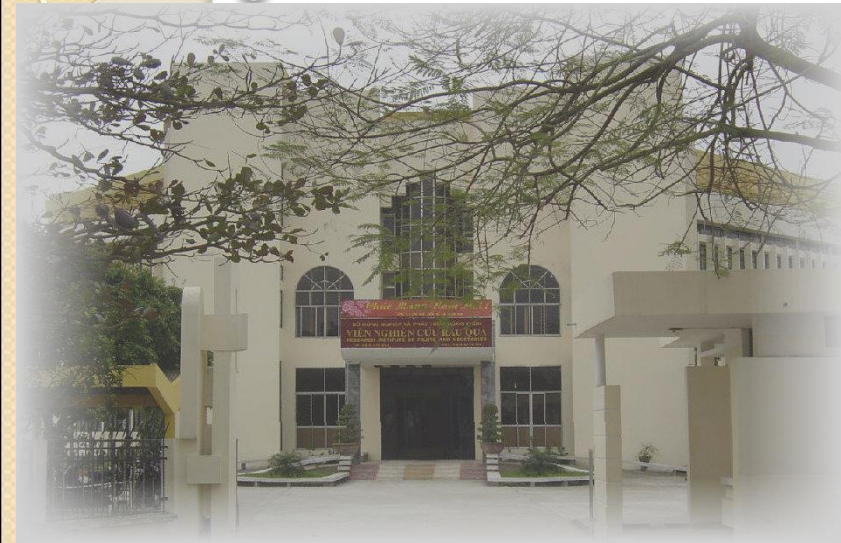
Research Institute for Fruits and Vegetable (RIFAV)