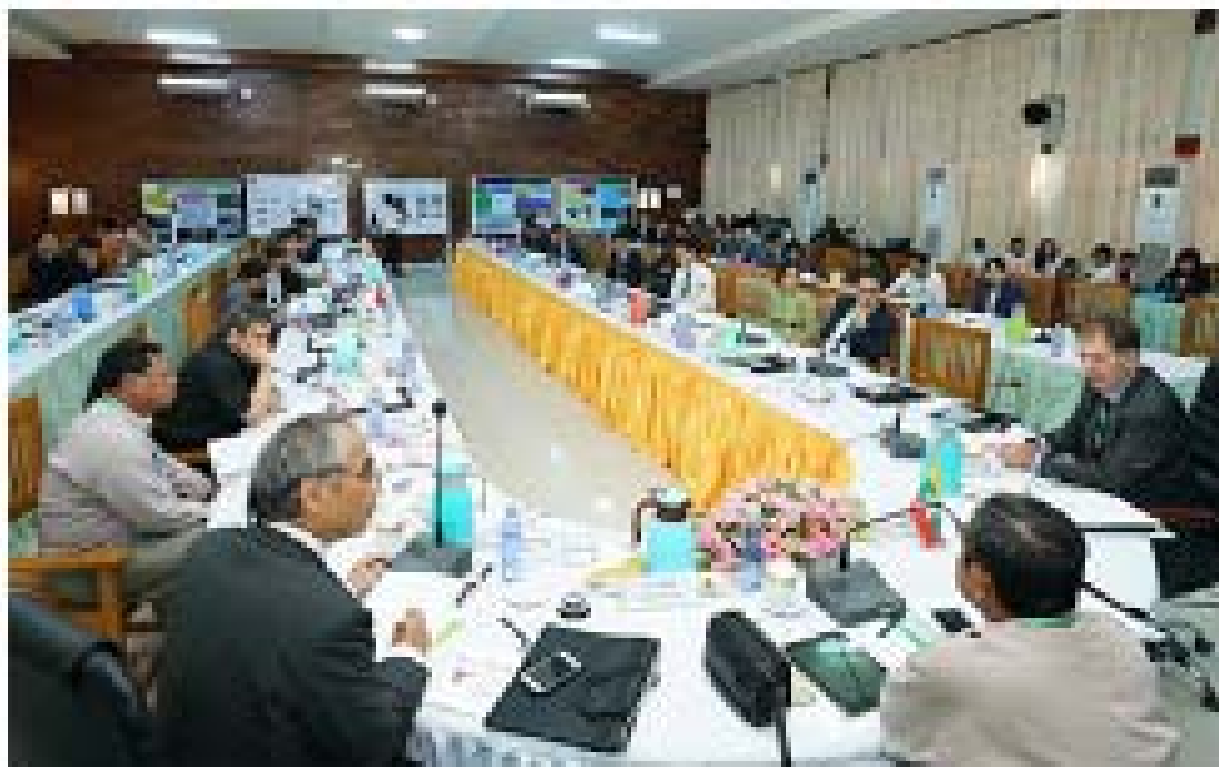
The 10th Forum Meeting in Nay Pyi Taw, Myanmar on 11 September 2017