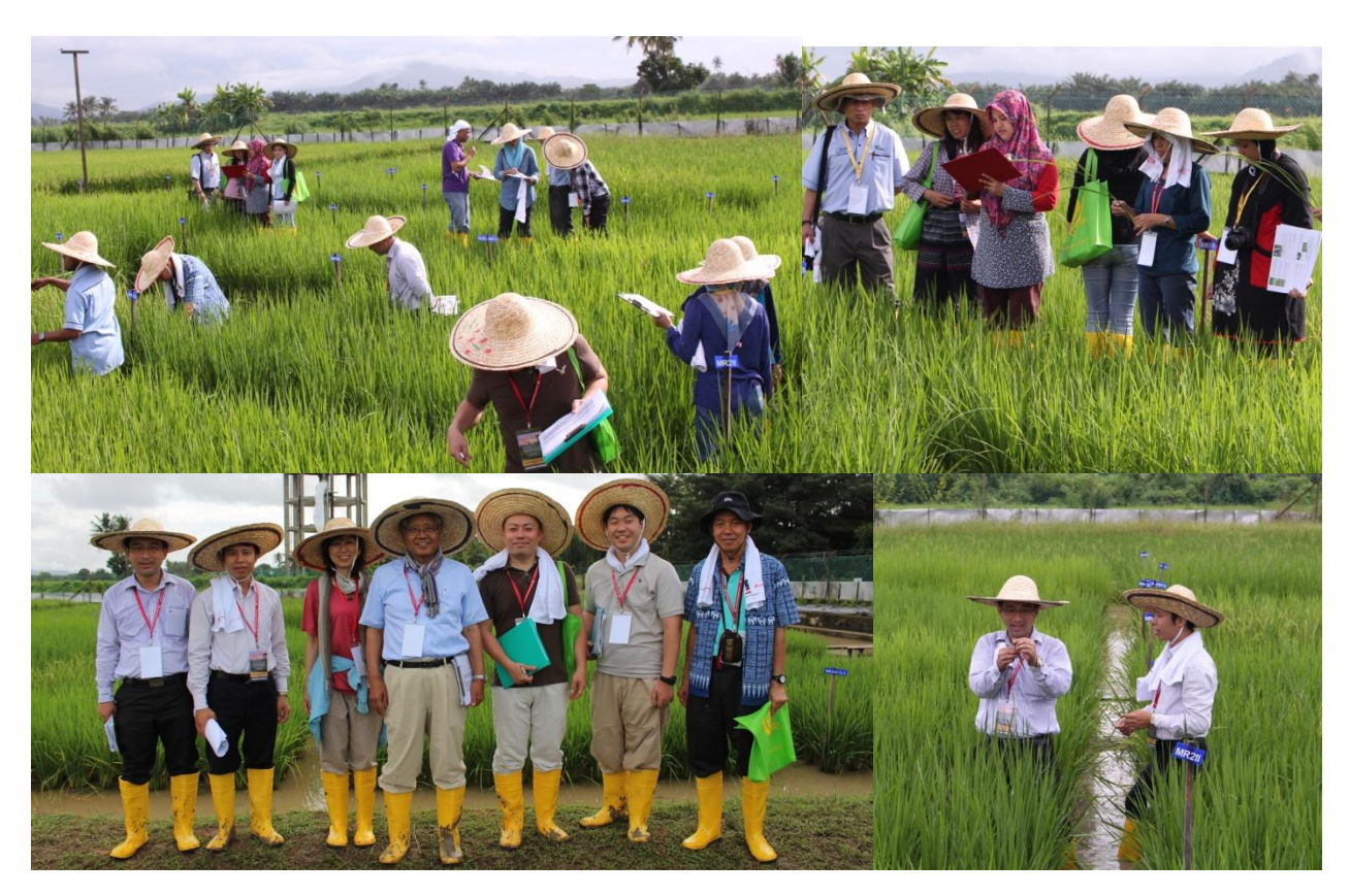
Figure 3.1.1 Practical session: observation and measurement at field.

Observation and measurement data were collected based on UPOV Technical Guidelines for Rice. Participants were guided by the experts from Japan and Vietnam during the session.